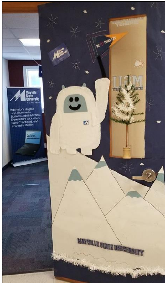
Left: Jade Erickstad at Mayville State – LRSC Site