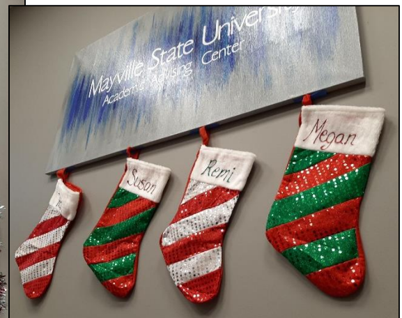
Merry Grinchmas (Advising Center)

Participants not pictured: The Business Office, Admissions, Academic Records, and the Math Department.