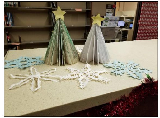
Top right: Learning Commons