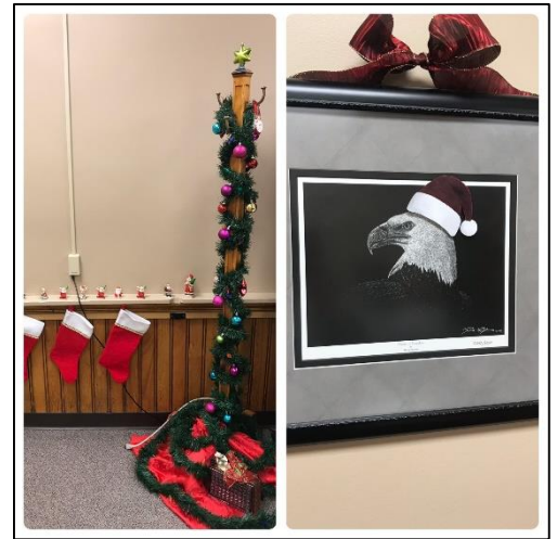
Bottom right: Budget Cut Christmas (Financial Aid)