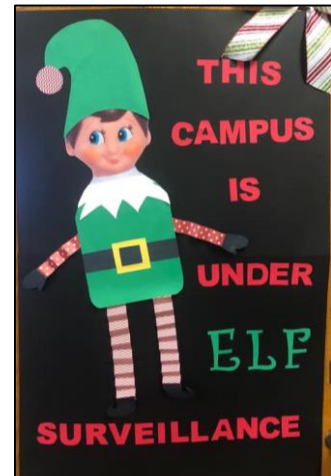
Above: ExL Elves (Extended Learning)