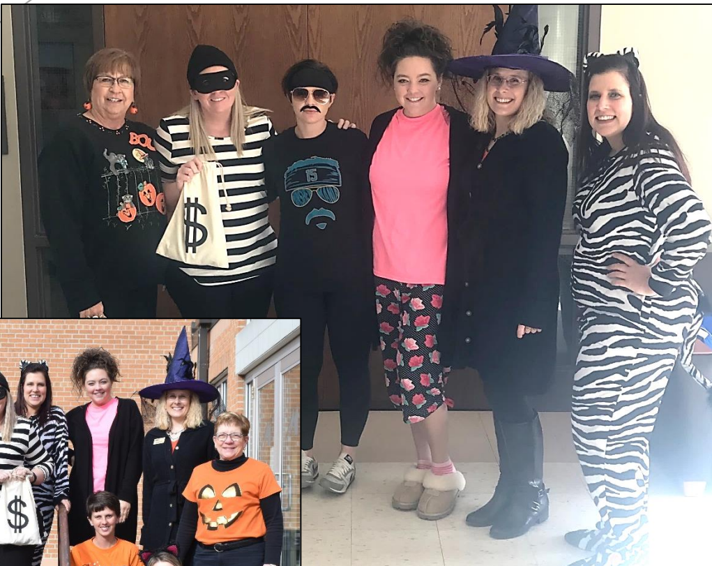
Above: Members of MSU Staff Senate in their Halloween costumes