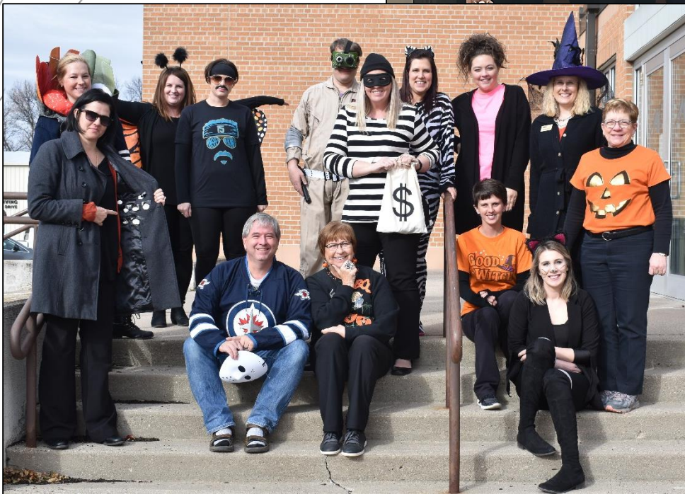
Left: Staff and faculty members posed for a Halloween picture in front of Campus Center